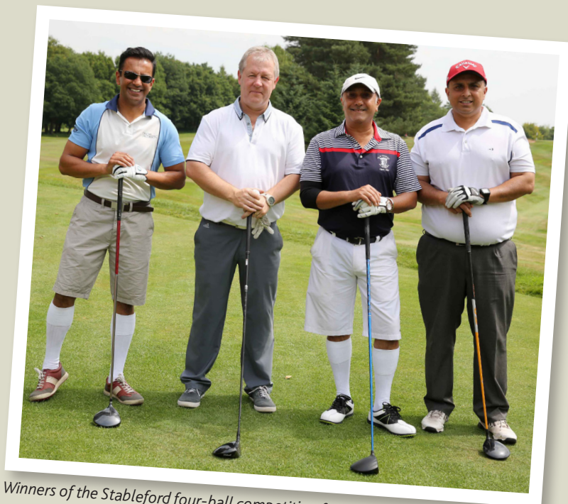
Winners of the Stableford four-ball competition from Forgeco.

"Our thanks go to the 40 golfers who entered, as well as Blackwell Golf Club for ensuring that the day ran smoothly, especially the bar staff at the half way house."